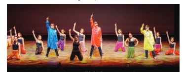
Kulture Kool performers display Bollywood Dance Moves.